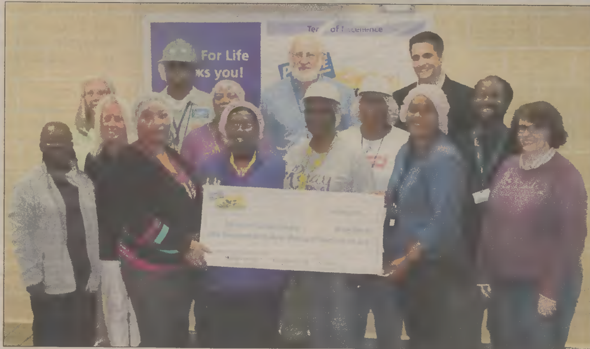
Associates from Perdue's operation in Kelford present a check for nearly $150,000 raised to support Bertie County Relay For Life.

"Associates here in Lewiston have a long history of