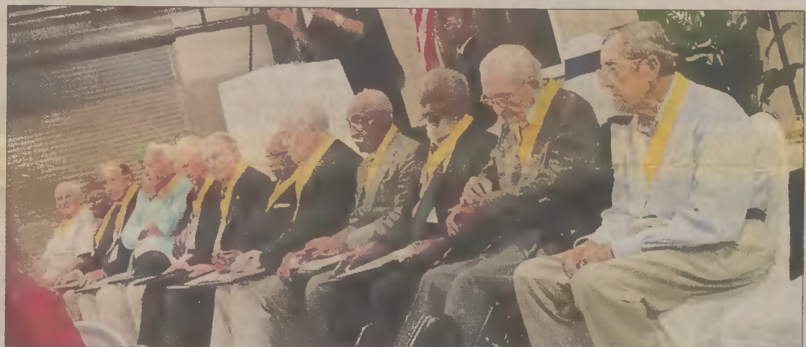
A total of 17 veterans from World War II and the Korean War were honored at a banquet Oct. 13.

The families and friends of the honorees and the honorees themselves were instrumental in being able