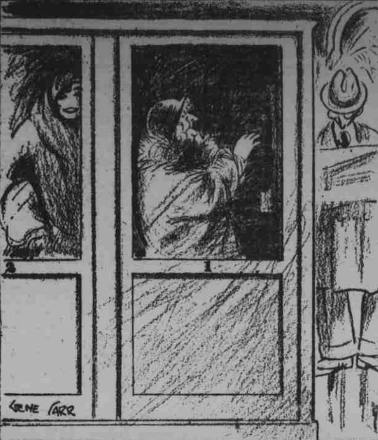
Dear Old Lady—"I'm Putting an Extra Nickel in the Slot for You, Dear. Now Hurry with the Number!"