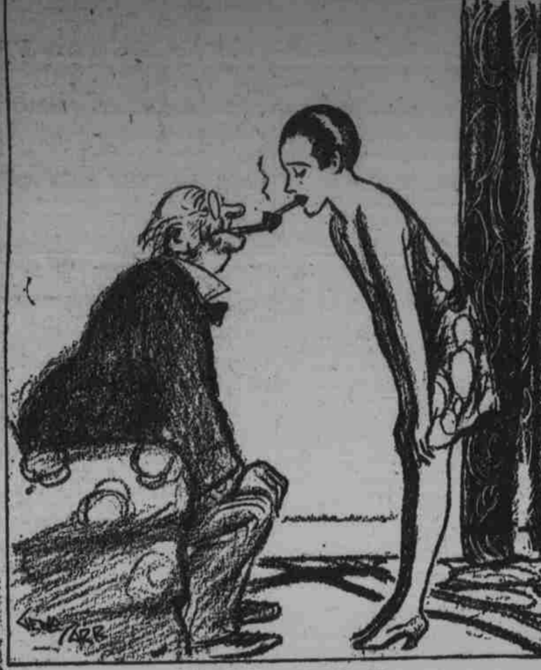
"Thank You, Grandpa!"