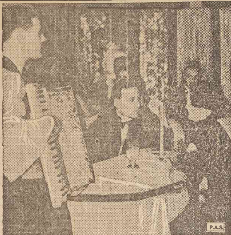
IOWA CITY . . . The newest educational experiment here at the University of Iowa is the liquorless night club. It was inaugurated in late November with a complete floor show of student performers, student waiters and student patrons. The idea upon which it is founded is "that students will have home town entertainment and will remain off dangerous highways over the week-ends." Photo shows the "Silver Shadow" opening night diners.