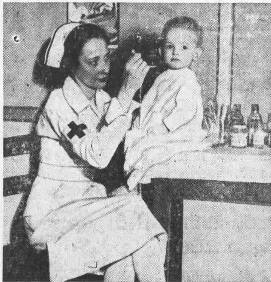
This scene was enacted many times in refugee centers established by the Red Cross during the Ohio-Mississippi Valley flood. Inevitably floods bring the danger of disease as drinking sources become contaminated and large groups of people are thrown together. The medical-health service of the Red Cross serves thousands each year, and is maintained by membership funds contributed to the organization at the time of its annual Roll Call from Armistice Day to Thanksgiving.