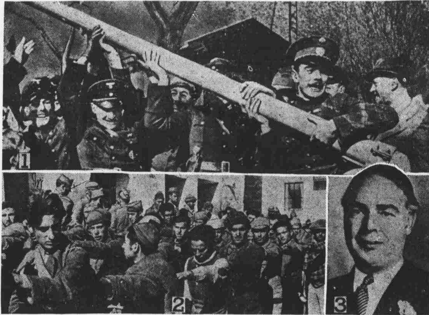
1—Customs men of Germany and Austria shown tearing down barricades that marked the limits of their respective nations, following Hitler's successful Nazi coup. 2—Spanish loyalist prisoners captured recently on the Alcaniz front do a lock-step under their captors' eyes. 3—Leslie Hore-Belisha, youthful British secretary of war who is speeding England's rearmament program.