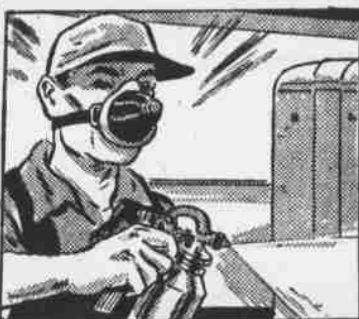
1. Not a gas mask, but a special nose mask to guard his breathing, is worn by this spray painter at his job in one of the General Electric plants.

America's "soldiers of production," men and women working in the plants of American industry, have their uniforms, too.