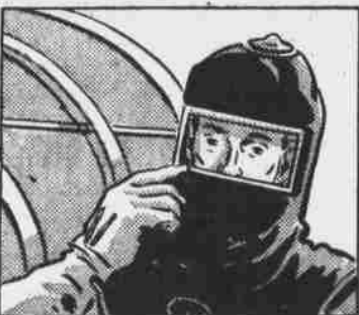
3. Frankenstein? No, just another G-E worker. His job is sandblasting big turbine castings for Uncle Sam's ships at one of the General Electric plants.