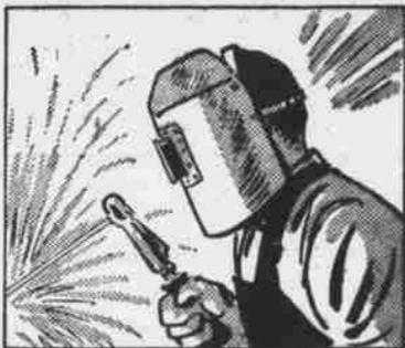
4. The helmet he wears is to protect him from light! The rays from a welder's arc could cause blindness if he did not wear this strange headgear.

General Electric believes that its first duty as a good citizen is to be a good soldier.