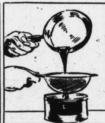
Strain the Rest Through a Kitchen Sieve, or Cheesecloth, into a Clean Tin Can. Don't Use Glass Jars or Paper Containers.