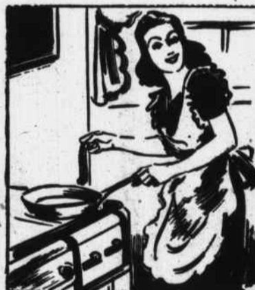
Save All the Cooking Fat Left in Your Frying Pan or Roaster. After You Have Used What You Need in Preparing Other Foods, Then—