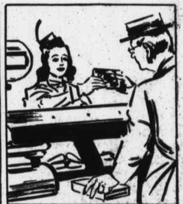
When the Can is Filled, Take It to Your Butcher, or Local Frozen Food Locker Plant, Who Will Pay You for the Grease.