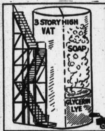
The Tallow is Boiled in Huge Vats, and by Adding Caustic Soda, 88% is Turned into Soap; the Rest Settles to the Bottom as Glycerine Lye.