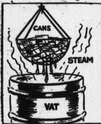
From These It Goes to the Renderer Who Steams or Boils Out the Fat, Salvages the Cans for Refinishing, and Renders the Fat into Tallow.