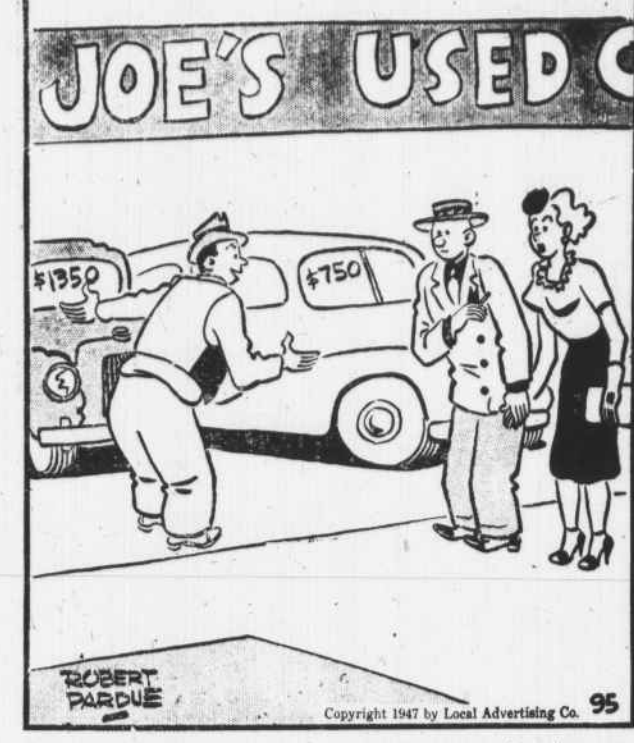
"Frankly, this is the best buy-it's had a motor tune-up at BURRELL MOTOR CO.

adam were finished on the fol- goal under the secondary bond issue program. Some 6,036 miles Richie road, 8 mile; Norton of farm-to-market roads have been hard-surfaced and anoth-The Commission has finished er 9,825 miles stabilized for allone-half of Governor Scott's weather travel during the past paving two years.