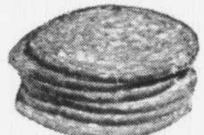
These slices from the same meat were left uncovered five days in an Admiral Dual-Temp. Moist-cold kept them fresh, appetizing, flavorful.