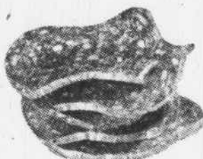
These cold meat slices were left uncovered five days in an ordinary refrigerator. Curled edges and discoloring show how they have dried out.