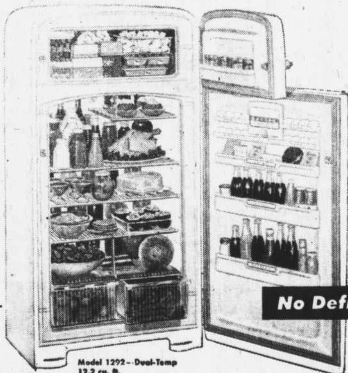
Model 1292 - Dual-Temp 12.2 cu. ft.

Ordinary refrigerators quickly dry out foods, leaving them tasteless, worthless. But the unique moist-cold climate of the Admiral Dual-Temp keeps all kinds of foods fresh and flavorful... for days on end... without lids or wrappings, without any transfer of odors or flavors. Here, too, is the coldest-cold freezer of any refrigerator on the market. You can quick-freeze at temperatures as low as 52° below freezing, store up to 72 pounds of frozen foods. No wonder it's America's most-wanted refrigerator! See it now!