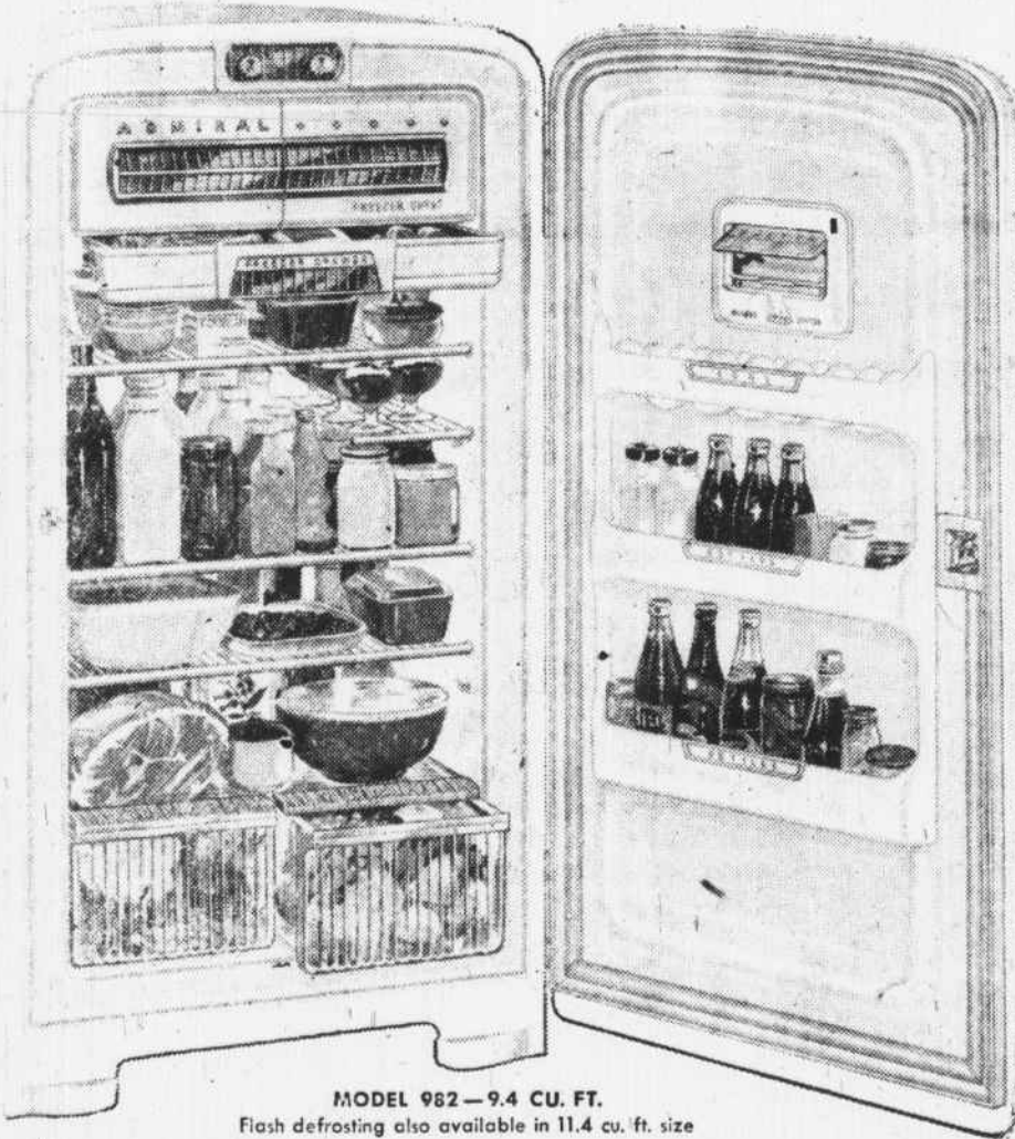
MODEL 982—9.4 CU. FT. Flash defrosting also available in 11.4 cu. ft. size

NEWEST, LATEST DEVELOPMENT IN HOME REFRIGERATION