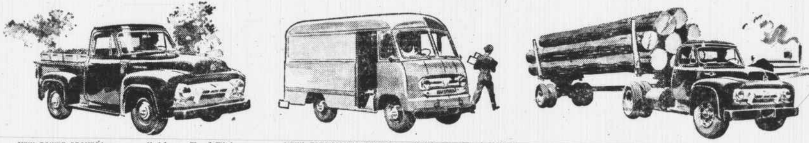
NEW POWER BRAKES* now available on Ford Pickup (shown) and all "1/2-ton" models! You save on driving effort—your stopping is up to one-fourth easier! Fordomatic Drive* for no-clutch driving!