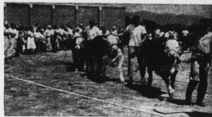
TOP BEEF CALVES in the county were shown last Thursday afternoon at the county fair by 4-H and F. F. A. members on the grounds at Franklin High. Livestock shows were held each of the three days of the fair.