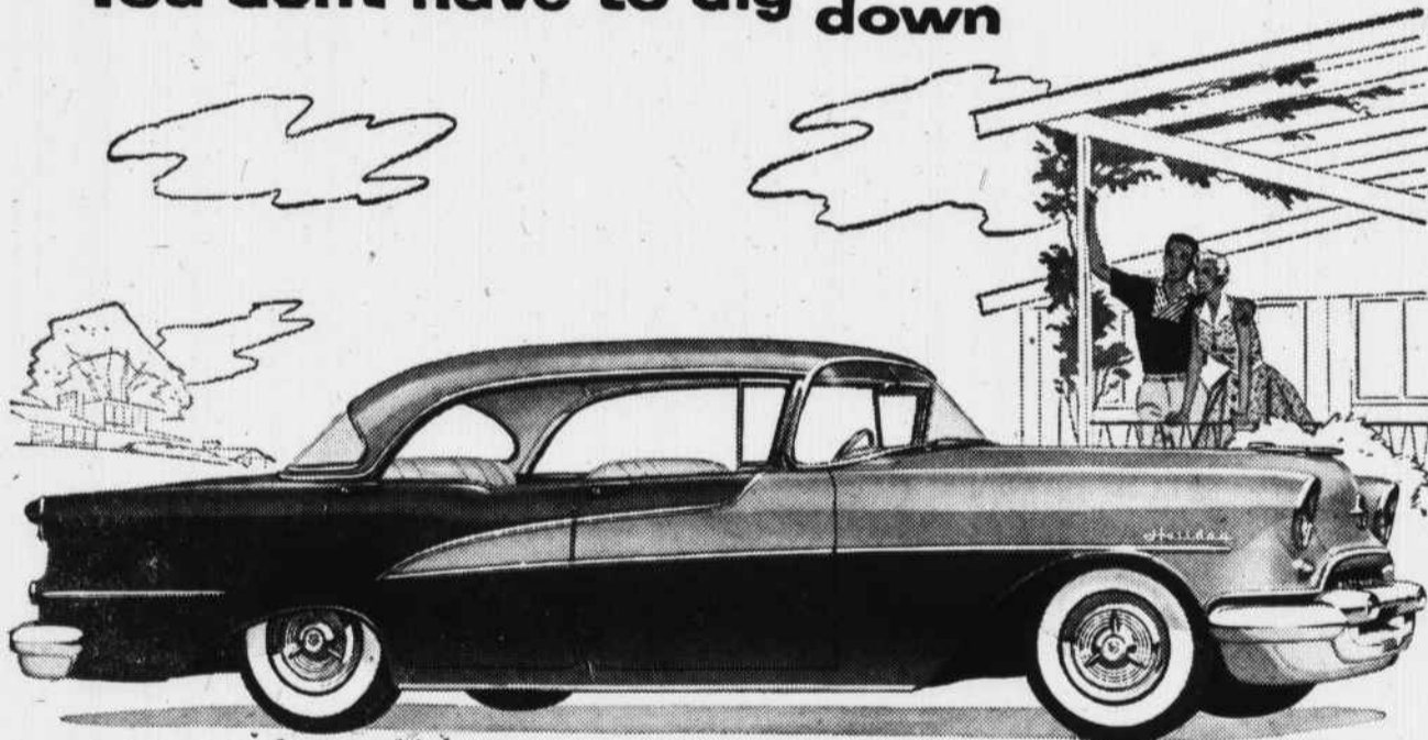
Super "88" Holiday Sedan —hardtop with 4 doors!