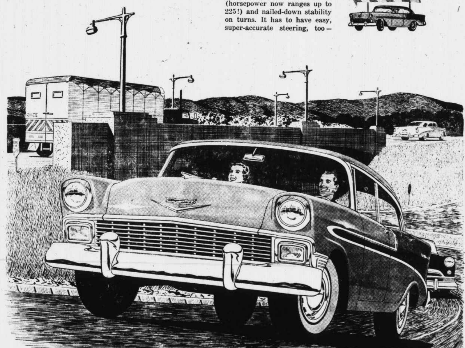
The Bel Air Sport Sedan—one of 19 new Chevrolet beauties. All have directional signals as standard equipment.