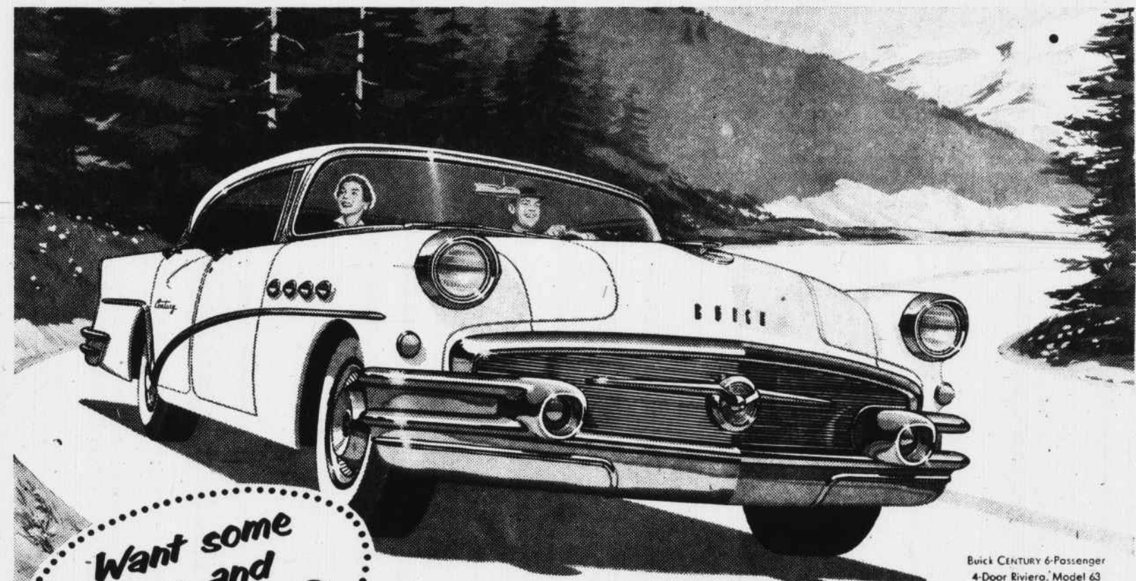
Buick CENTURY 4-Door Riviera, Model 63