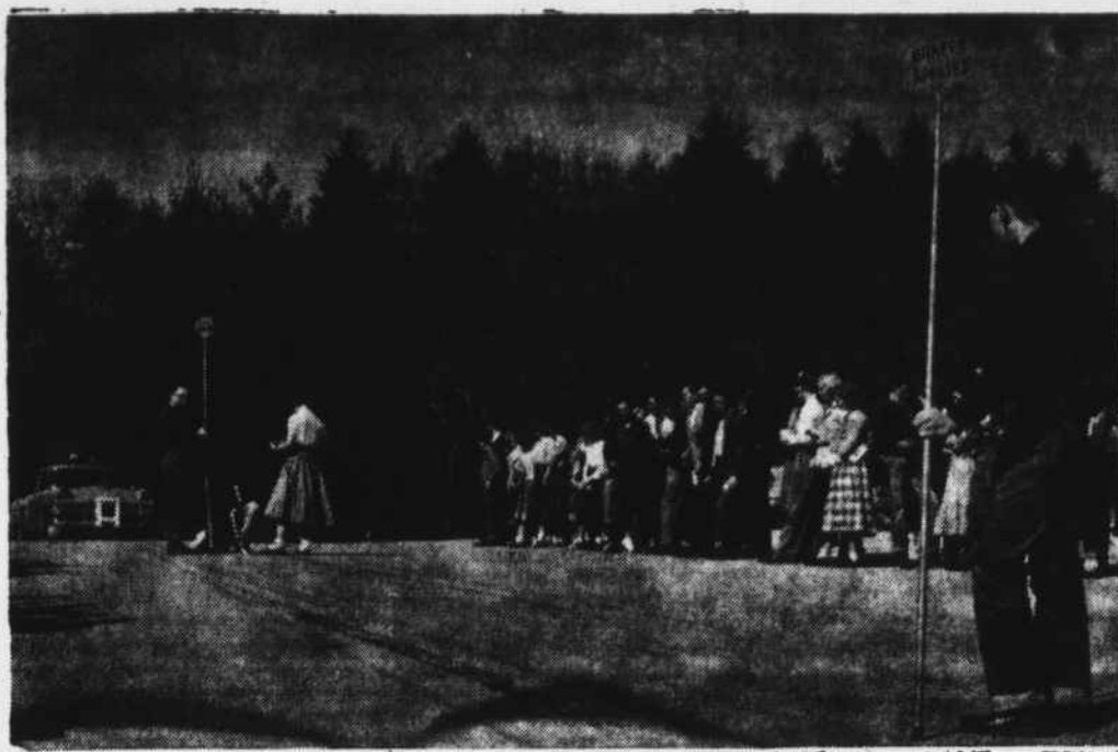
FRANKLIN HIGH STUDENTS line the road at the side of the high school for the test driving demonstrations. The student in the foreground holds a marker showing where the demonstration car (left background, turning around) applied brakes. Students further down are measuring the distance it took the car to come to a complete stop.