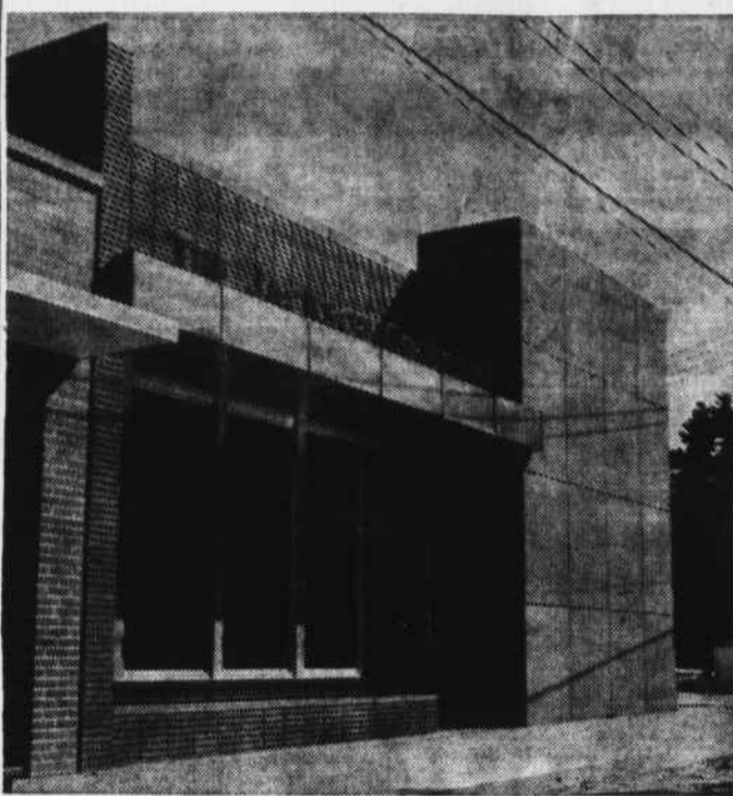
Formal dedication of the new Highlands branch of the Jackson County Bank is slated for October 6 (See story on Page 1). This exterior picture of the new $60,000 building on Fourth Street shows the modern front of glass and brick.