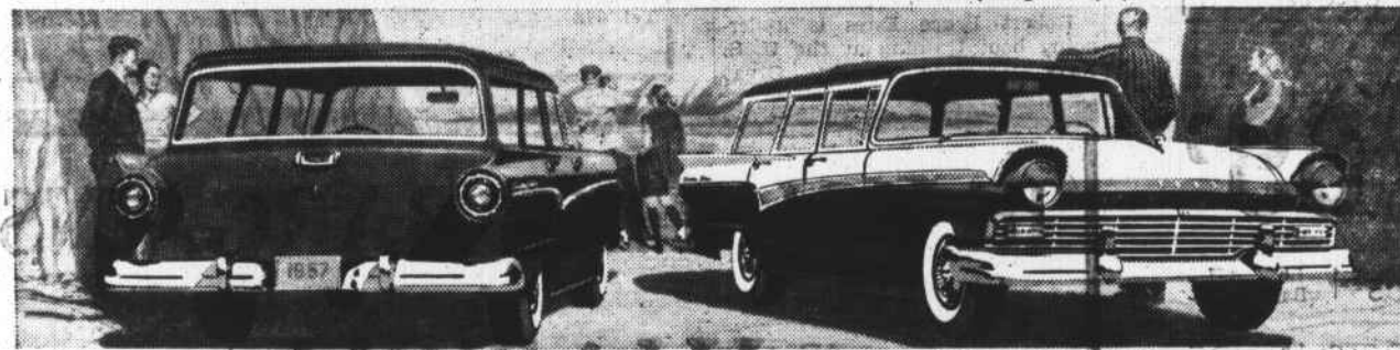
The 6-passenger Country Sedan