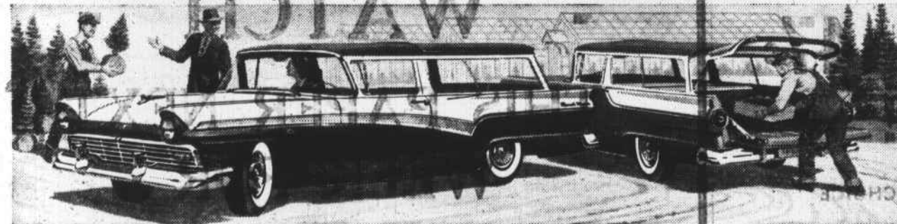
The Del Rio Ranch Wagon