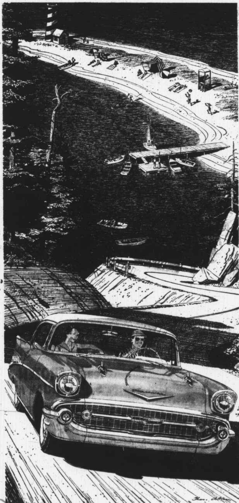
Sweet, smooth and sassy—that's Chevrolet all over. Above, you're looking at the Bel Air Sport Coupe.

Clings to the road like a stripe of paint!