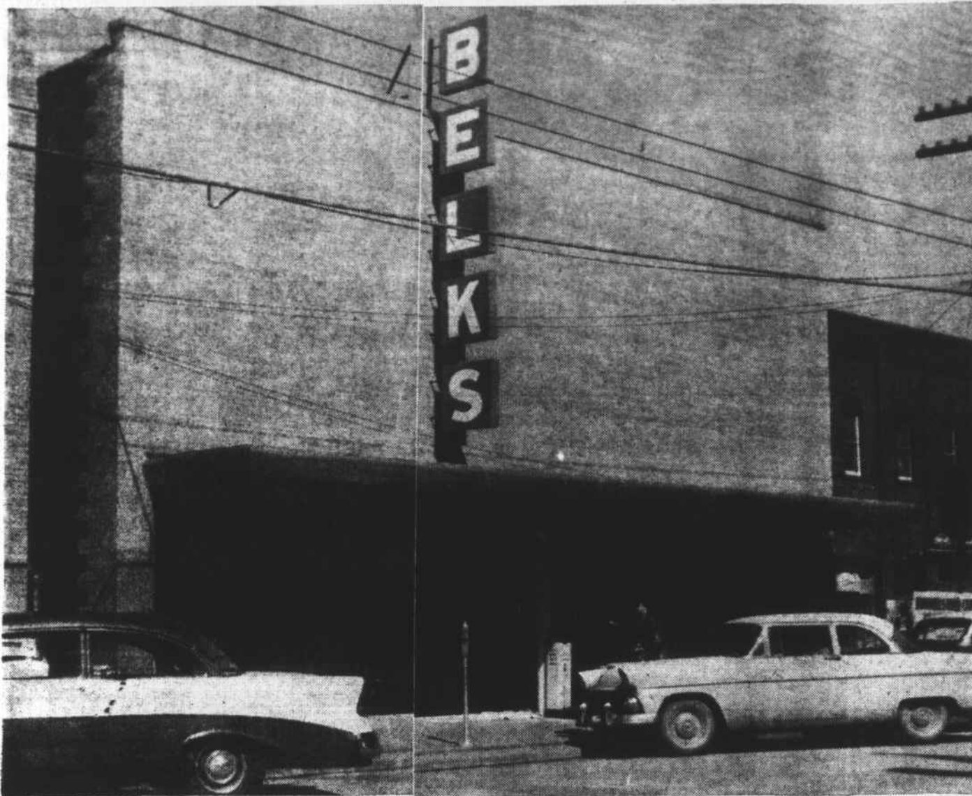
The Front of Belk's Department Store's New Main Street Building