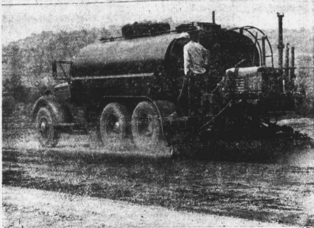
The scalding asphalt primer mixture used in highway paving is distributed over the road bed by a tank truck rigged with a spraying apparatus. This one was caught in action Saturday on US 23-441 as the priming project on the new highway neared its completion.