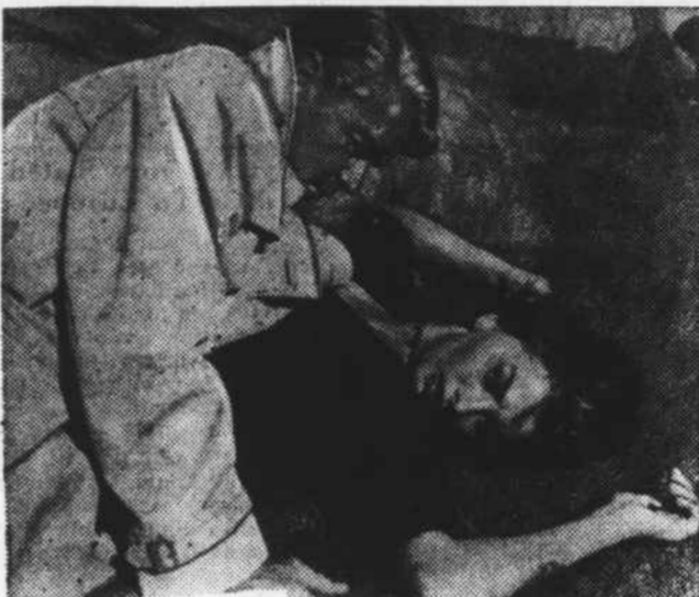
A scene from "Boy on Dolphin" playing Sunday-Tuesday at Franklin Drive-In.—Adv.

Hog prices will soon begin their seasonal advance.