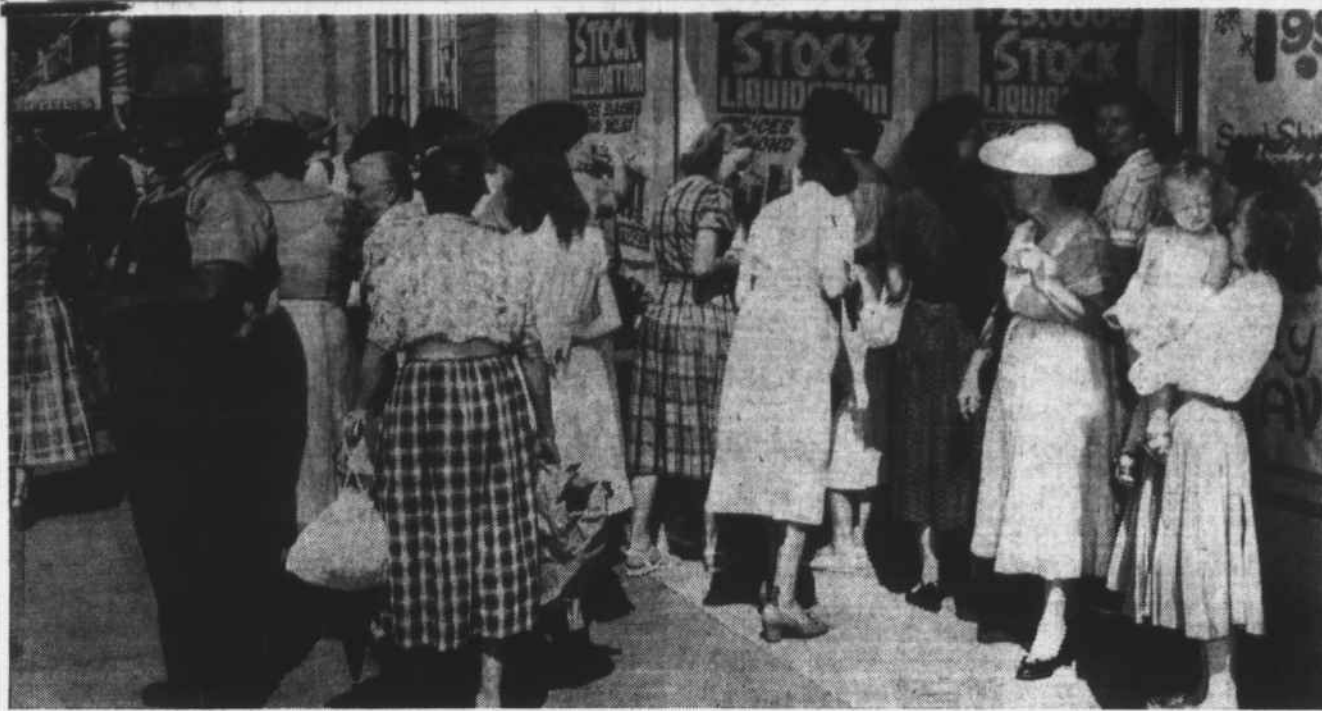
THEY CAME TO TOWN FRIDAY FOR THE 'SIDEWALK CARNIVAL'

This street scene on Main Street in Franklin was typical anywhere in the shopping section during the day Friday while merchants heaped bargains outside their stores for "Sidewalk Carnival". Note the woman in the foreground with a shopping bag packed with merchandise. (Staff Photo)