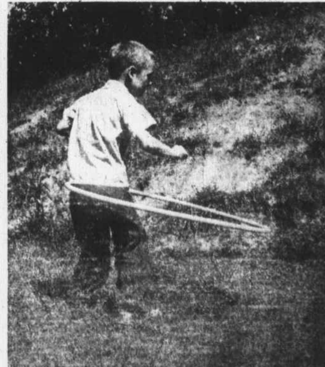
THE END RESULT...