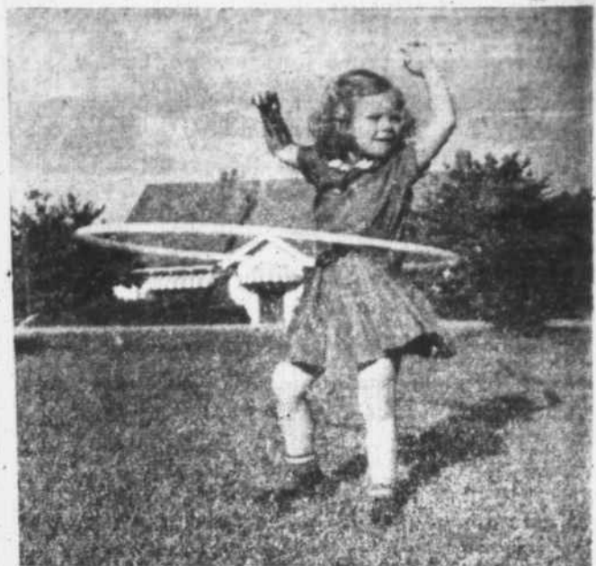
Quite Horsaey, 3, Says It's Easy