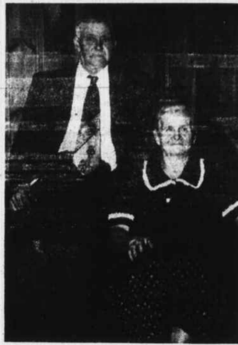
COUPLE HAS ANNIVERSARY