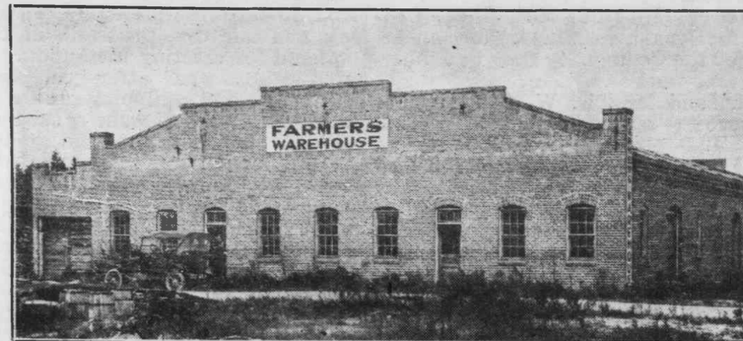
Co-operative Tobacco Warehouse

The Blue Fertilizer Company, whose plant is located on the outskirts of Aberdeen along the A. & R. right of way, is one of Aberdeen's most important industries. The company