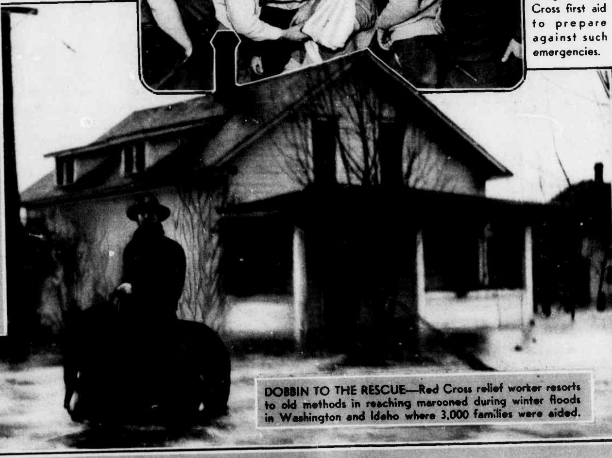
DOBBIN TO THE RESCUE—Red Cross relief worker resorts to old methods in reaching marooned during winter floods in Washington and Idaho where 3,000 families were aided.