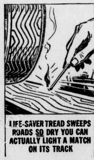
LIFE-SAVER TREAD SWEEPS ROADS SO DRY YOU CAN ACTUALLY LIGHT A MATCH ON ITS TRACK

It may be a truck. It may be a suddenly swerving car. Time and again on wet roads you're faced with situations like these where a quick stop can mean the difference between life and death. Take our advice. Equip your car with new Goodrich Safety Silvertowns. As the never-ending bars of the Life-Saver Tread roll over a dangerous film of water they act like a battery of windshield wipers - sweep the water right and left - force it out through deep drainage grooves. Thus, the dried road under your car is constantly ready to give you the quickest, safest non-skid stops you've ever had. For safety tomorrow get Silvertowns today!