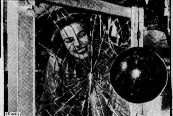
(GLASS IS SAFE . . .) With emphasis on safety at National Auto Show, one literally "smashing" demonstration saw 16-pound bowling ball slammed against pane of new high-test safety plate glass. Standard equipment all around on many 1940 models. Despite terrific impact, young lady crouching behind glass feared no flying particles.