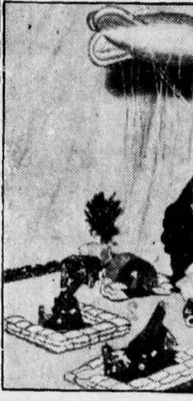
BRITISH TOYS, 1939 . . . Christmas toy previews in London reflect war situation as balloon "barrage" with aircraft-entangling drop lines, anti-aircraft guns with sandbag protection, A. R. P. shelters and army lorries loom as popular Santa Claus items.