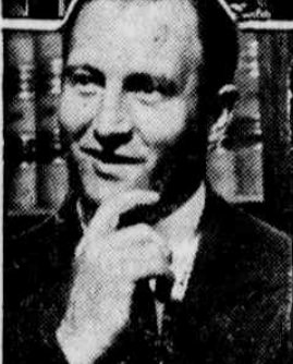
WHAT PRICE? . . . Government's yardstick for gauging fair war-time retail prices will be low chain store prices made possible by efficient operating methods, predicts George Feldman, Washington economist and author, declaring anti-chain store taxes must be repealed to aid Federal coordination of distributive system in possible emergency.