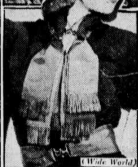
DONE WITH RIBBONS . . . An engaging set of three matching accessories—beret, fringed scarf and belt—offered as suggestion for national ribboncraft competition. This ensemble was whipped up with about nine yards of ribbon, belt buckle, scarf fastener and a bit of skill with the fingers.