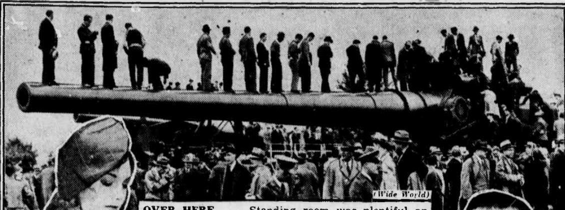
OVER HERE . . . Standing room was plentiful on giant 16-inch guns, among variety of coast defense weapons tested and shown to public at 20th annual meeting of Army Ordnance association at Aberdeen Proving Ground, Md. High-ranking officers of the services, and congressmen and industrialists watched tests.