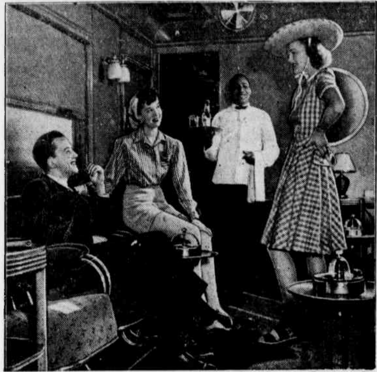
A pleased passenger aboard the Seaboard's "Orange Blossom Special" gets a preview of the latest Florida fashions in a novel style show presented Thursday, January 25th on the train en route from New York to Palm Beach.

For the Boy friend, a nice VALENTINE, get it at Hayes'.