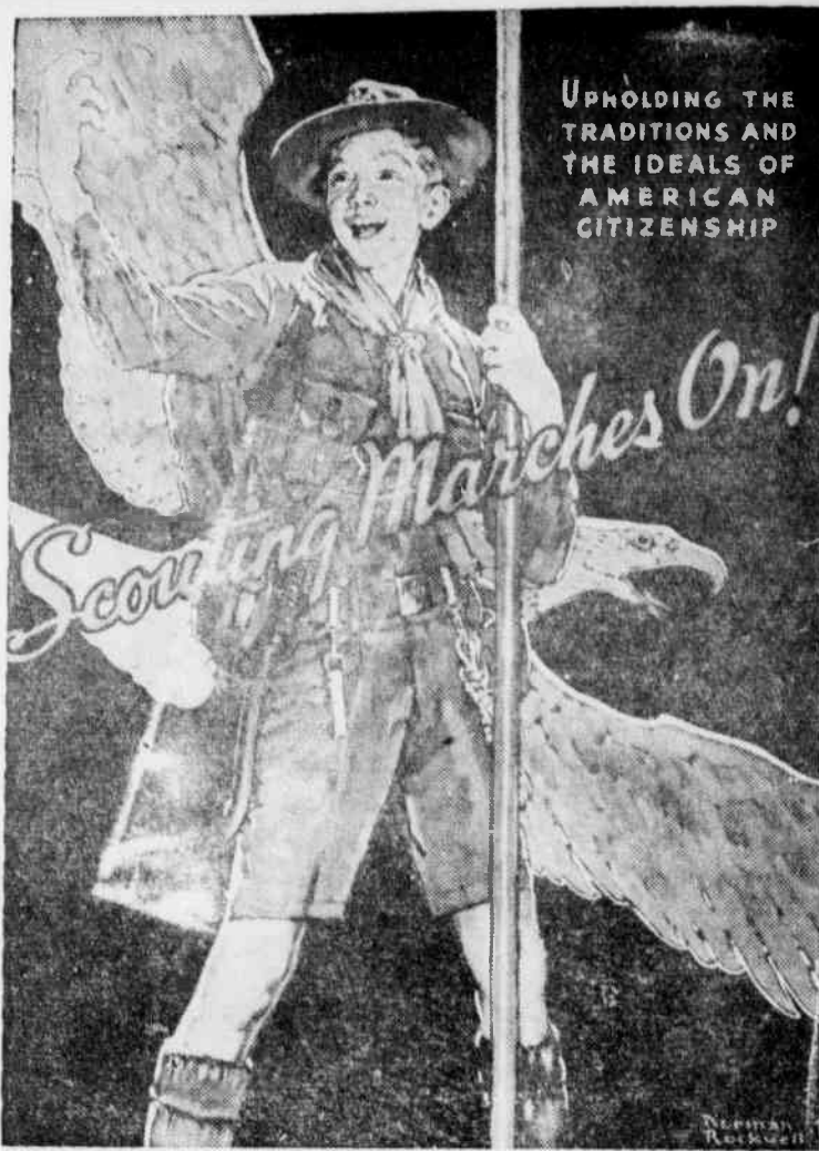
Boys of Sandhills Join with Scouts of Nation on the Thirtieth Anniversary of Scouting. Many Window Displays Here.