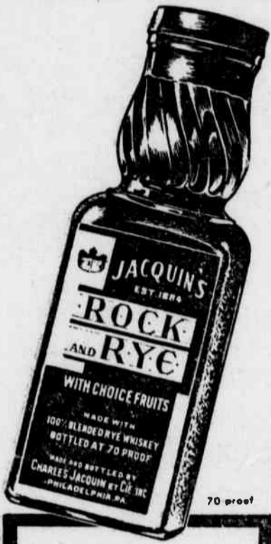
CHARLES JACQUIN & Co., Inc. PHILADELPHIA, PA. EST. 1884