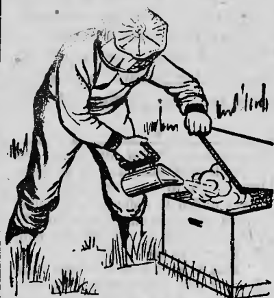
When handling insects such as bees, man must protect himself.

Who is crowding whom? In his battle for his place on the earth, Man often forgets that the insects have been there at least 100 times as long as he. Lice on his chickens, ticks on his cattle, fleas on his dog, aphids in his garden and thousands of other annoying attacks warn mankind that the insect world is still to be reckoned with.