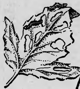
Two fifths of the vegetable growth on the earth is eaten by insects sooner or later.

Who is crowding whom? In his battle for his place on the earth, Man often forgets that the insects have been there at least 100 times as long as he. Lice on his chickens, ticks on his cattle, fleas on his dog, aphids in his garden and thousands of other annoying attacks warn mankind that the insect world is still to be reckoned with.