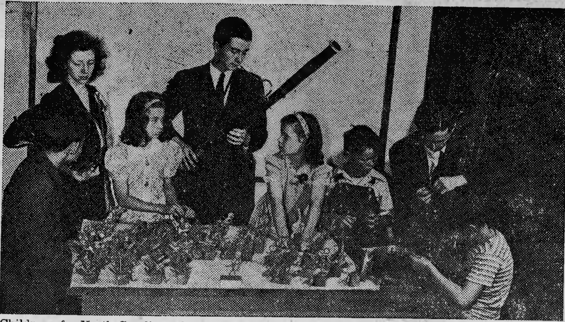
Children of a North Carolina school made the model orchestra shown above out of pipe-cleaners, as part of their preliminary studies of orchestra make-up and placement before a visit by the N. C. Symphony. The picture shows members of the orchestra inspecting the model.