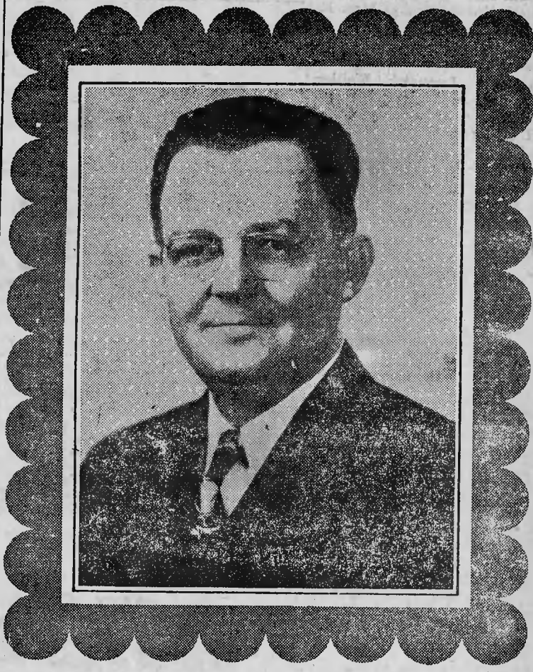
SENATOR DUDLEY J. LeBLANC

There are many wheels in any successful organization—in fact, in The LeBlanc Corporation there are more than 300 human wheels, but all these rotate around one big wheel—Dudley J. LeBlanc, the man who gave the world one of the truly great medical discoveries—HADACOL.