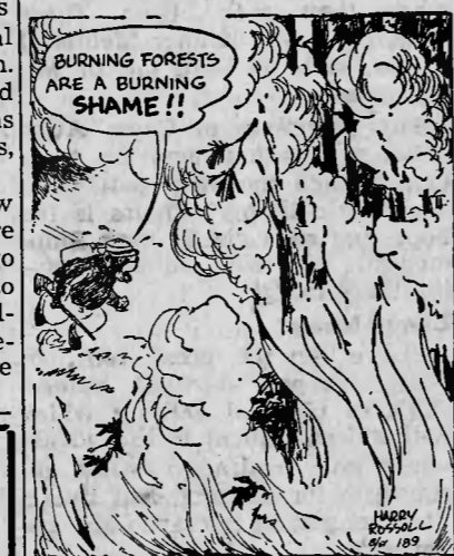
It is tragic to burn our forest lands—stop this waste!