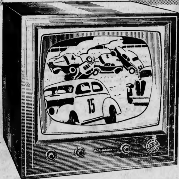
RCA Victor Lambert (Model 21T208)