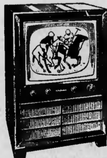
RCA Victor Lansford (Model 21T218)