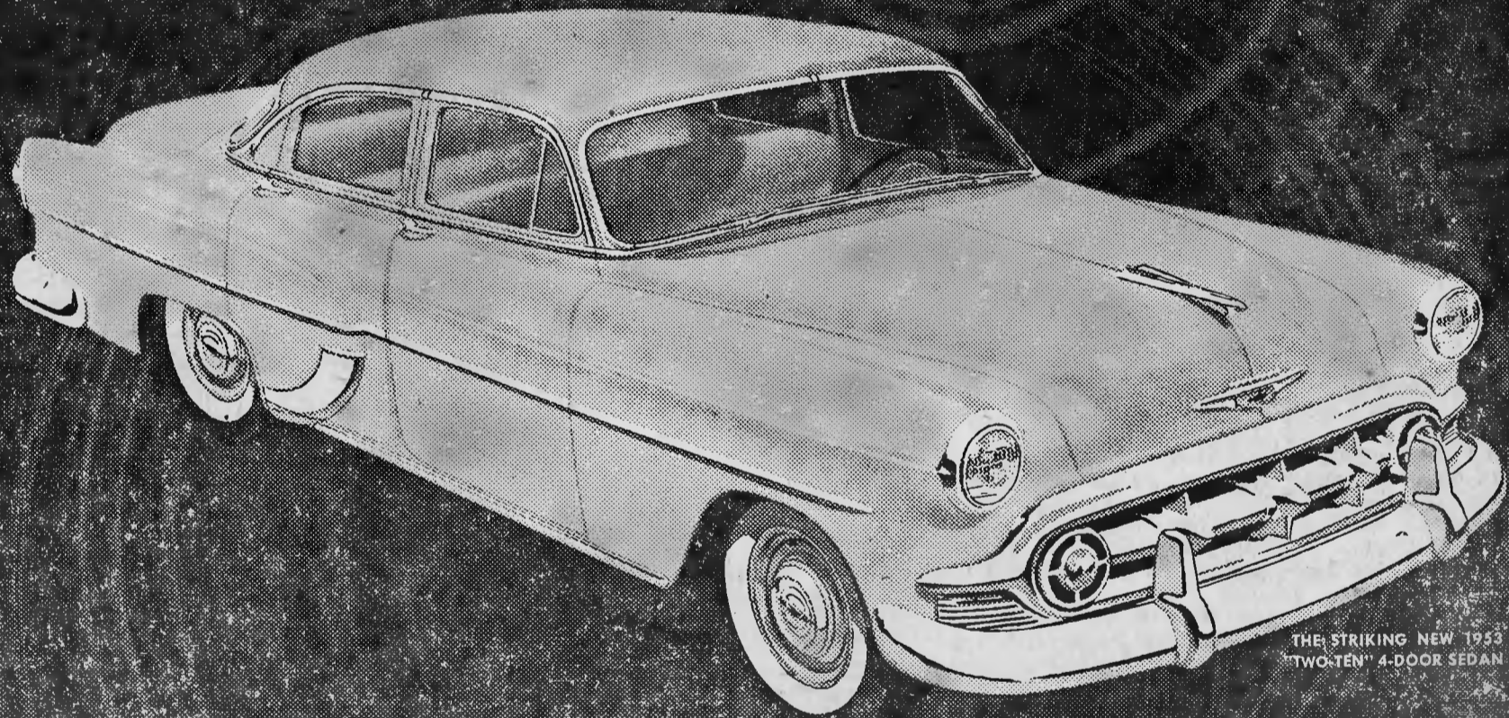
THE STRIKING NEW 1953 "TWO-TEN" 4-DOOR SEDAN

So startlingly new! So wonderfully different!