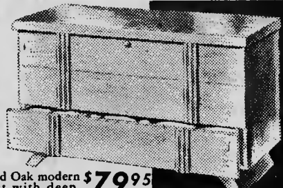
Blond Oak modern $79.95 chest with deep, roomy drawer in base.