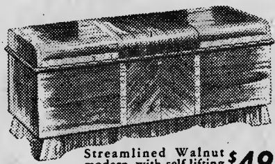
Streamlined Walnut modern, with self-lifting tray. $49.95

For Trousseau Gathering or Modern Home Storage!