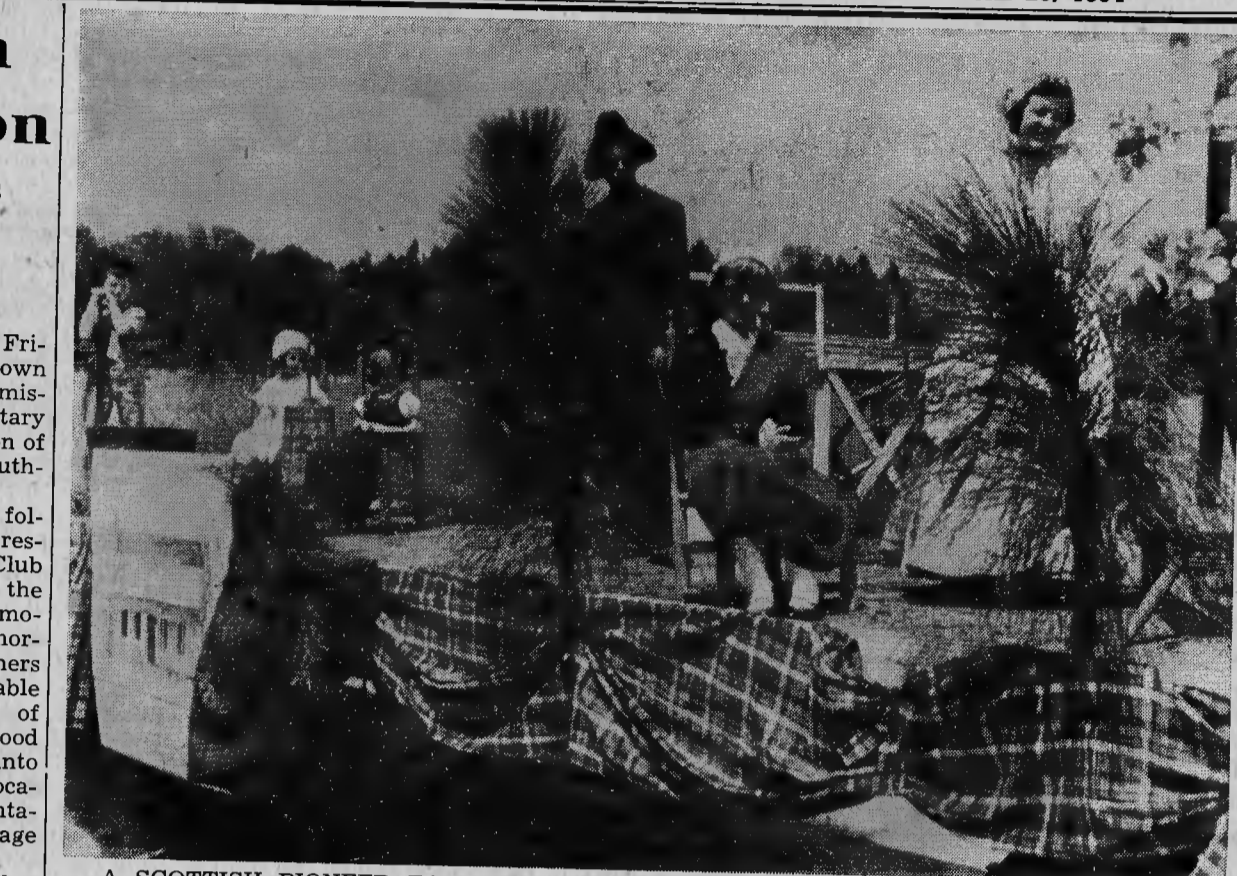
A SCOTTISH PIONEER FAMILY, keeping house in early-settler fashion, occupied the big float which was Moore County's entry in the Bicentennial Parade at Fayetteville Tuesday.