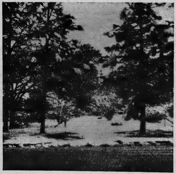
CLINGING SNOW—Snow that fell Sunday afternoon and night stuck to everything it touched, creating a wonderland of beauty for persons arising Monday morning.

The annual Storey Cup award for 1954 was presented to Troop 936 of Carthage in a Boy Scout court of honor held Monday at the Pinehurst Community Church.