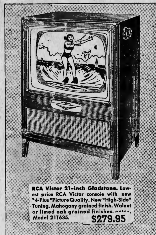
RCA Victor 21-inch Gladstone. Lowest price RCA Victor console with new "4-Plus" Picture Quality. New "High-Side" Tuning. Mahogany grained finish. Walnut or lined oak grained finishes. Model 21T635. $279.95

Brown's Auto Supply SOUTHERN PINES ABERDEEN