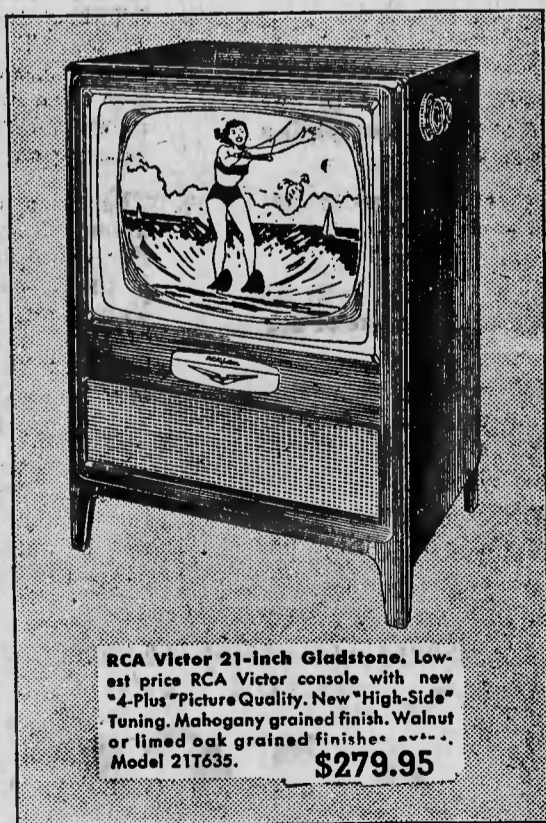
RCA Victor 21-inch Gladstone. Lowest price RCA Victor console with new "4-Plus" Picture Quality. New "High-Speed" Tuning. Mahogany grained finish. Walnut or lined oak grained finishes. Model 21T635. $279.95

Brown's Auto Supply SOUTHERN PINES ABERDEEN