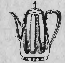
TOWN & COUNTRY, $325.*