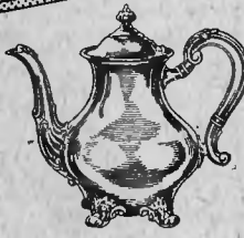
THE REGENT, $165.*

Open Wednesday all day and Friday Night 'til 8 until Christmas