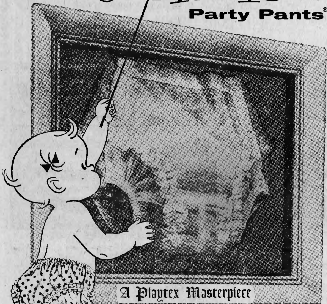
A Playtex Masterpiece

Ruffled nylon marquisette sprinkled with stars to match the twinkle in her eyes!