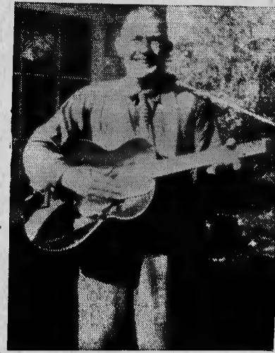
At Home . . .