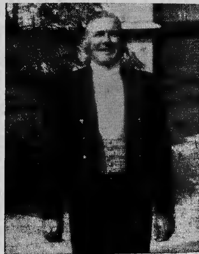
In The Movies . . .