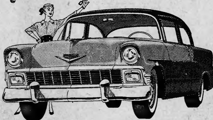
"One-Fifty" 2-door Sedan—with beautiful Body by Fisher!