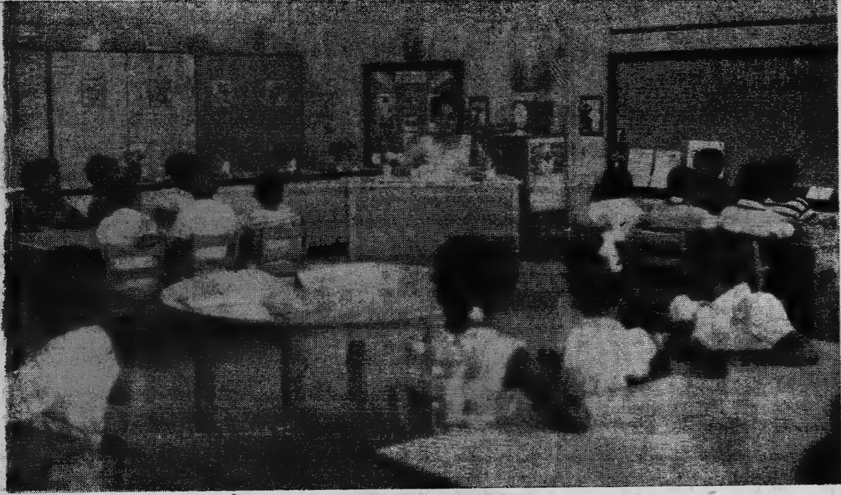
First Grade Room At West Southern Pines Wins Award