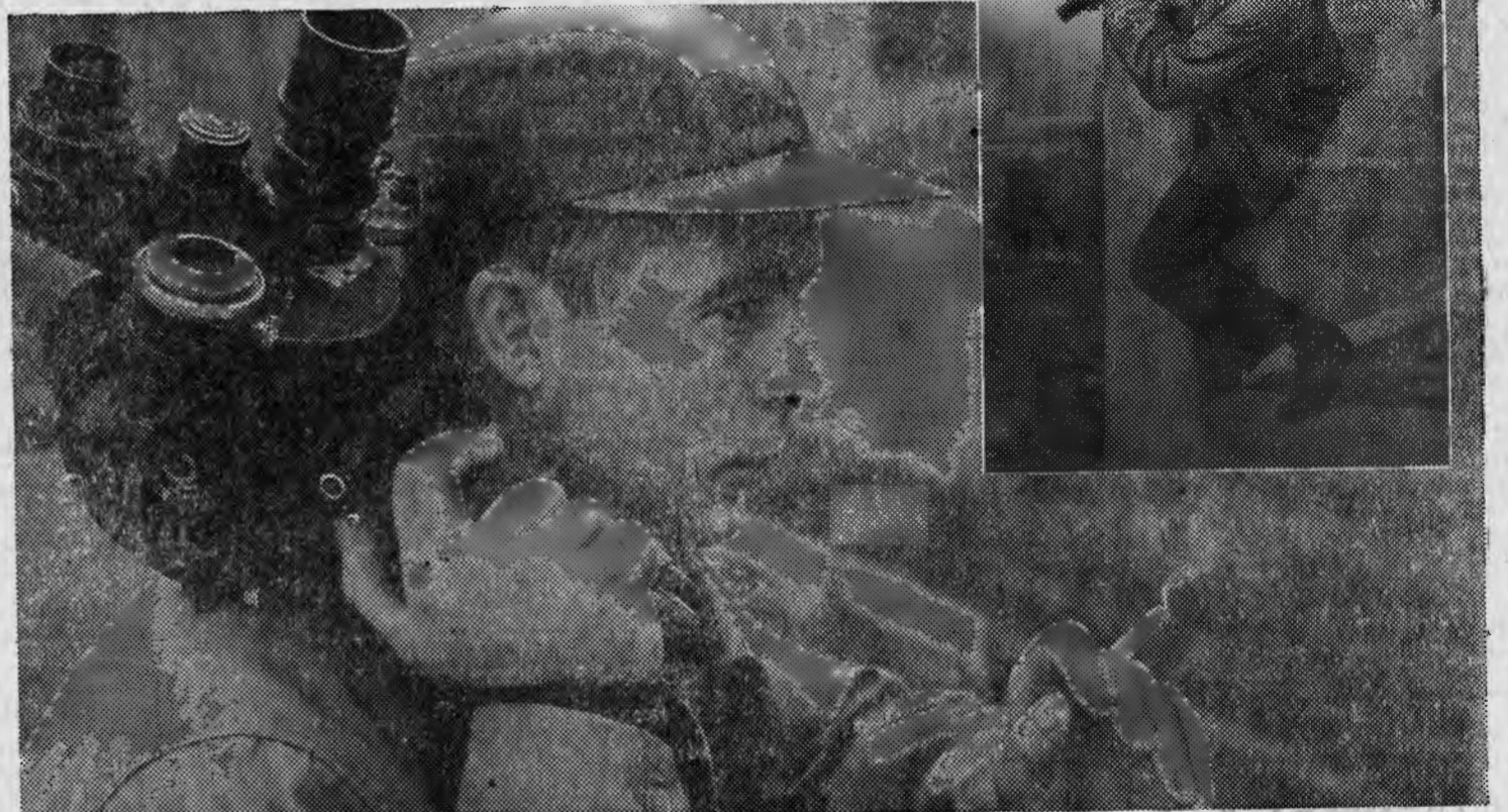
R. J. Reynolds Tobacco Co., Winston-Salem, N. C.