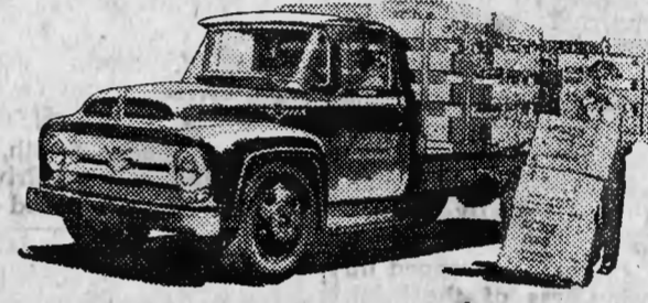
The hardest-working, biggest-saving "two-tonner" of them all is the Ford F-600. Only Ford offers a Short Stroke Six and three Short Stroke V-8's in this field. Max. GVW is 19,500 lb.