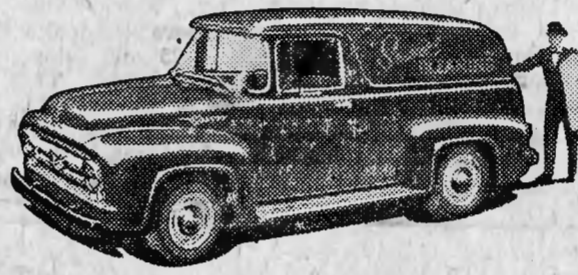
Ford's F-100 Custom panel is one of the top load carriers in its class. It provides 155.8 cu. ft. of cargo space in a smooth, fully lined interior and hauls up to 1,535 lb. of payload.