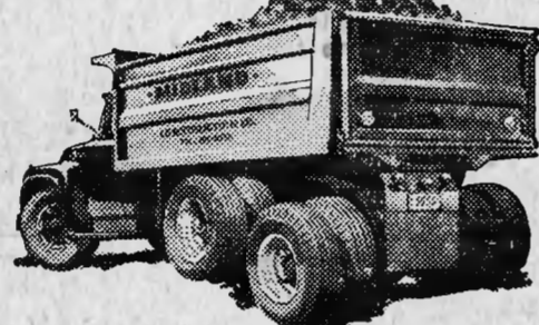
Ford tandem axle BIG JOBS are rated to carry more payload than comparable tandems of any of the leading manufacturers. T-800 model has max. GVW of 45,000 lb.—GCW is 65,000 lb.